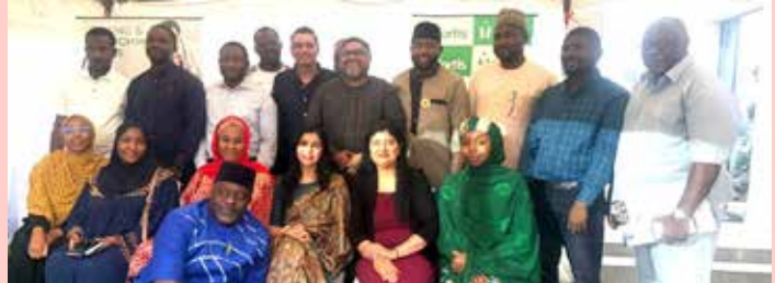
Kano, Nigeria IC Inauguration