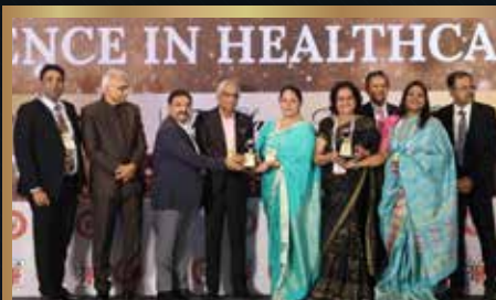
Fortis Hospital, Shalimar Bagh, New Delhi • Excellence in Hospital Operations (Clinical) •Excellence in Nursing Practices