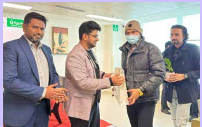
Fortis Hospital, Greater Noida