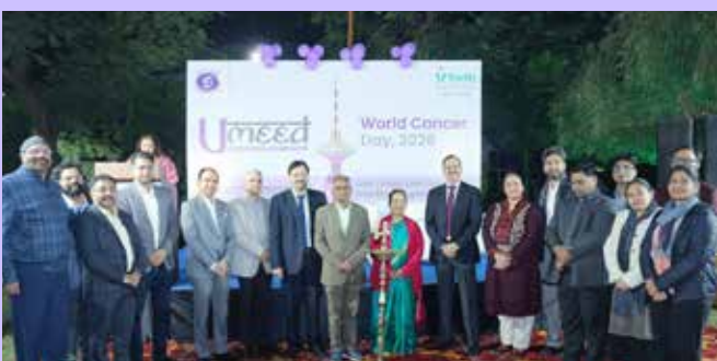
Fortis Hospital, Shalimar Bagh