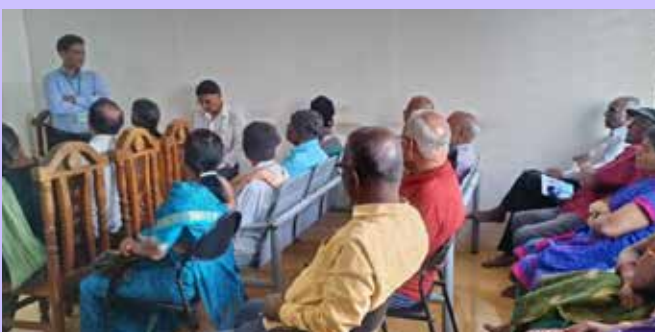
Fortis Hospital, Nagarbhavi, Bangalore