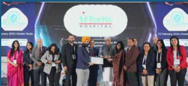
Fortis Hospital, Bannerghatta Road, Bengaluru - Kidney Transplant