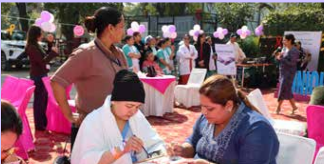
Fortis Hospital, Mohali