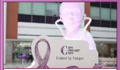
Fortis Hospital, Gurugram