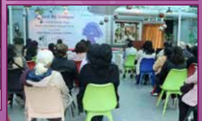
Fortis Hospital, Vasant Kunj