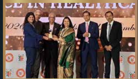
Fortis Lafemme, GK-2, New Delhi •Excellence in Infection Control Practices