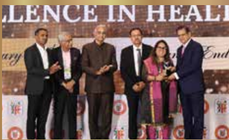
Fortis Hospital, Bannerghatta Road, Bengaluru •Excellence in Hospital Operations (Clinical)