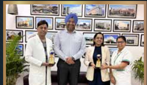
Fortis Hospital, Chandigarh Road, Ludhiana •Excellence in Infection Control Practices •Excellence in Emergency Services