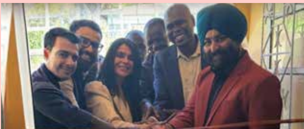
Eldoret, Kenya IC Inauguration