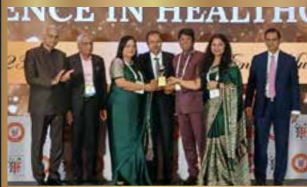
Fortis Hospital, Gurugram •Excellence in Infection Control Practices •Employee Centric Hospital