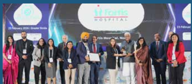
Fortis Hospital, Noida - Liver Transplant