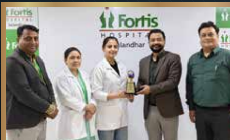
Fortis Hospital, Jalandhar •Excellence in Infection Control Practices