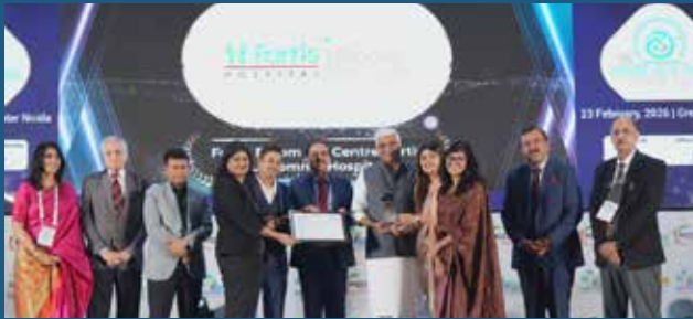
Fortis La Femme, GK – II, New Delhi (Bloom IVF Centre) - IVF & Reproductive Medicine