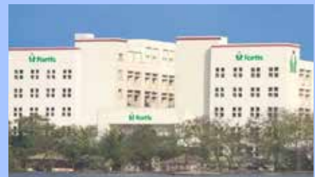
Hiranandani Hospital, Vashi

Doing all Fortisians proud, Fortis Escorts Heart Institute, New Delhi; Fortis Vasant Kunj and Hiranandani Hospital, Vashi - A Fortis Network Hospital have been recognised in Newsweek's 'World's Best Specialized Hospitals 2026' list, underscoring Fortis Healthcare's strength in Cardiac Sciences.