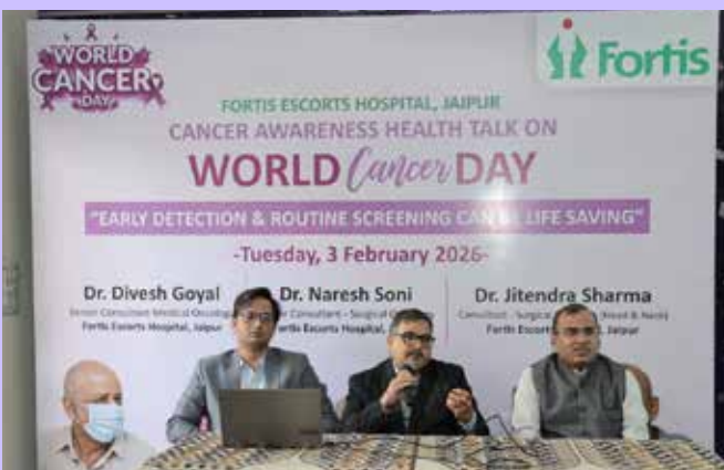
Fortis Escorts Hospital, Jaipur