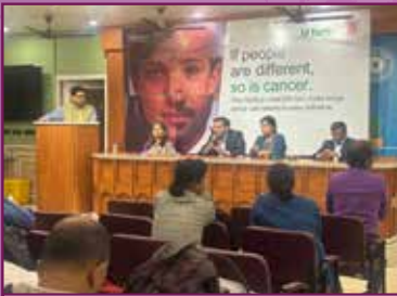
Fortis Hospital, Anandapur