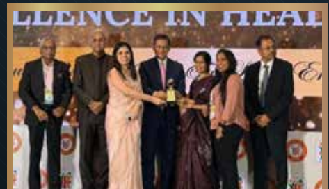
Fortis Hospital, Mulund •Excellence in Clinical Operations