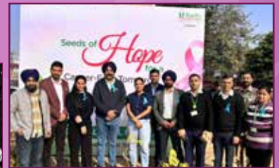
Fortis Hospital, Mall Road, Ludhiana