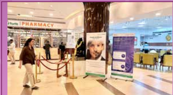
Fortis Hospital, Bannerghatta Road