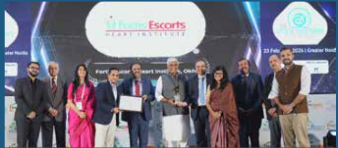
Fortis Escorts Heart Institute, Okhla, New Delhi - Paediatric Cardiac Sciences