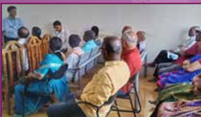
Fortis Hospital, Nagarbhavi, Bangalore