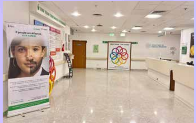
Fortis Hospital, BG Road, Bangalore