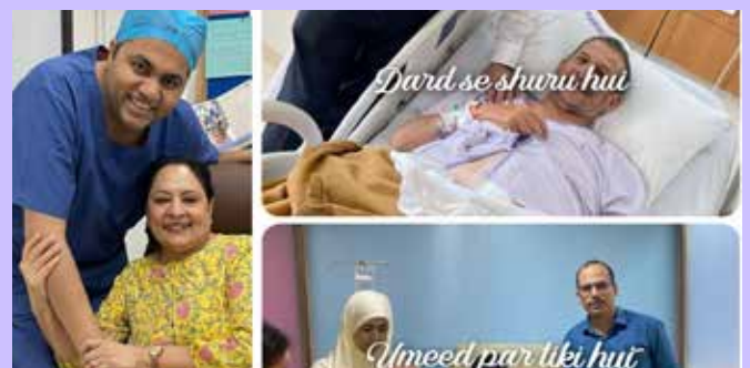
Fortis Escorts Heart Institute, Okhla