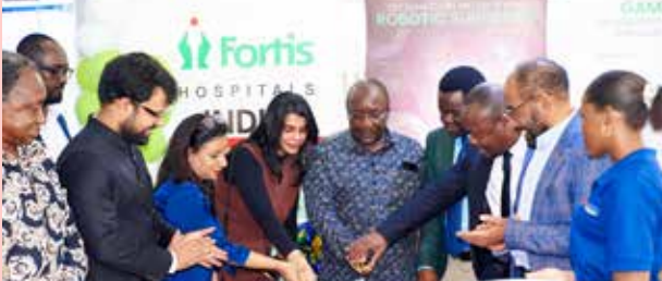
Dar es Salam, Tanzania IC Inauguration