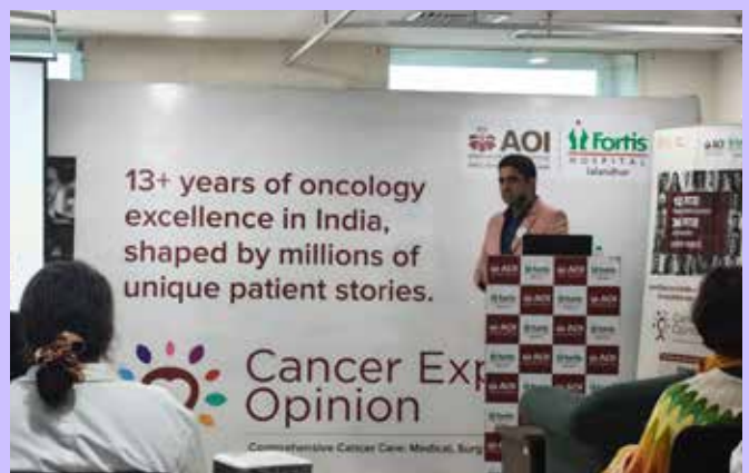
Fortis Hospital, Jalandhar