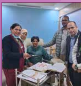
Fortis Escorts Heart Institute, Okhla