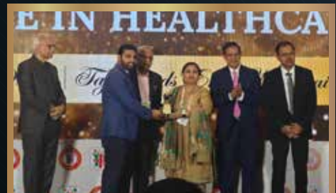
Fortis Hospital, Vasant Kunj, New Delhi •Employee-Centric Hospital