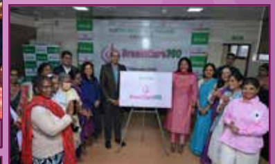
Fortis Hospital, Mulund