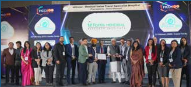
Fortis Memorial Research Institute, Gurugram - Neurology & Neuro Surgery and Bone Marrow Transplant