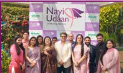
Fortis Hospital, Manesar