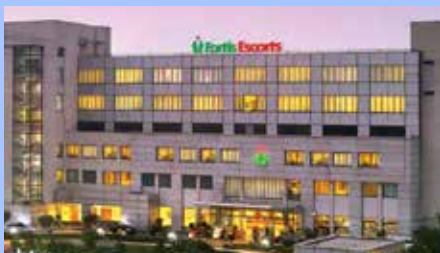
Fortis Escorts Heart Institute, New Delhi