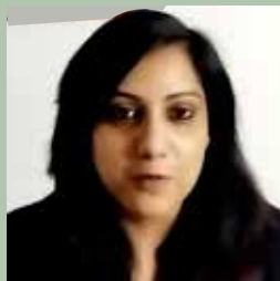
Rishu Singh Corporate Office, Gurugram