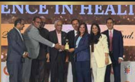
Fortis Hospital, Manesar •Excellence in Critical Care •Employee Centric Hospital