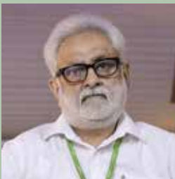
Pankaj Bakhr Corporate Office, Gurugram