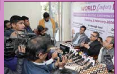
Fortis Escorts, Jaipur