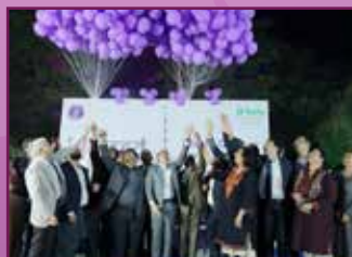
Fortis Hospital, Shalimar Bagh