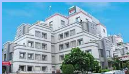
Fortis Hospital, Vasant Kunj