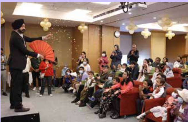
Fortis Hospital, Gurugram