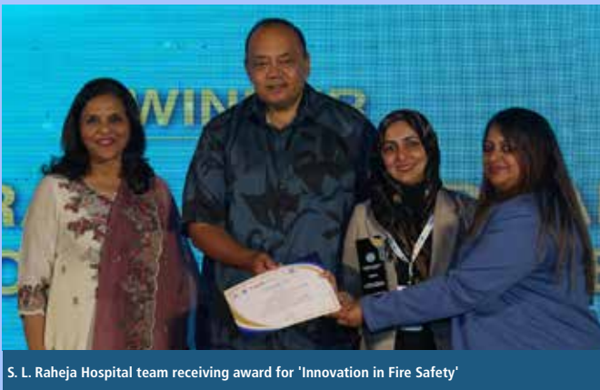
S. L. Raheja Hospital team receiving award for 'Innovation in Fire Safety'