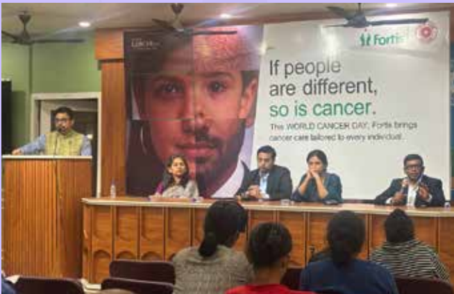
Fortis Hospital, Anandapur