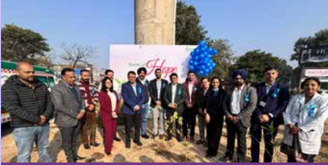
Fortis Hospital, Ludhiana