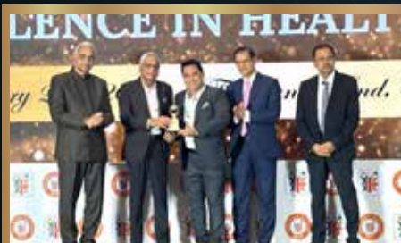
Fortis Hospital, Mohali •Excellence in Hospital Operations (Non-Clinical)