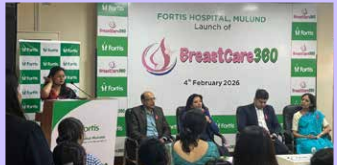
Fortis Hospital, Mulund