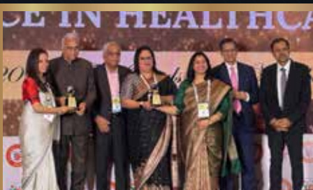
Fortis Escorts, Okhla, New Delhi •Excellence in Quality Beyond Accreditation •Excellence in Nursing Practices