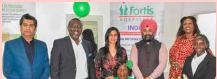
Nakuru, Kenya IC Inauguration

Reinforcing its commitment to expanding access to world-class healthcare beyond borders, Fortis Healthcare has successfully launched 4 Information Centres across key regions in Africa within a single month. With these additions, the total number of Fortis Information Centres in Africa now stands at 11, reflecting the organisation's steady expansion across the continent. The centres were inaugurated at: Dar es Salaam, Tanzania (February 6); Eldoret, Kenya (February 12); Nakuru, Kenya (February 13); and Kano, Nigeria (February 26).