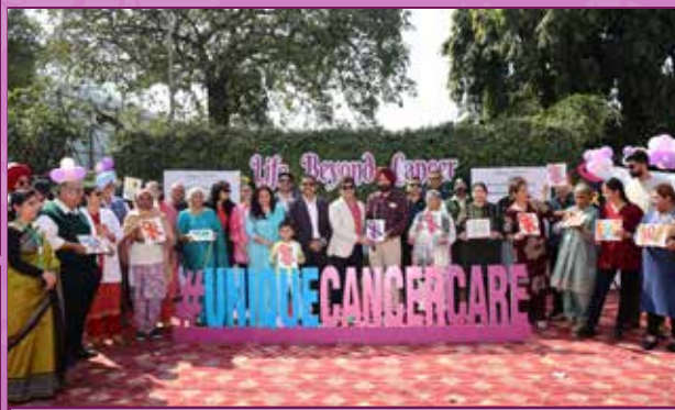
Fortis Hospital, Mohali