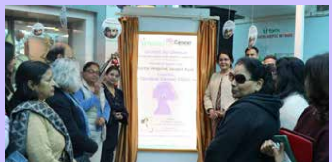
Fortis Hospital, Vasant Kunj