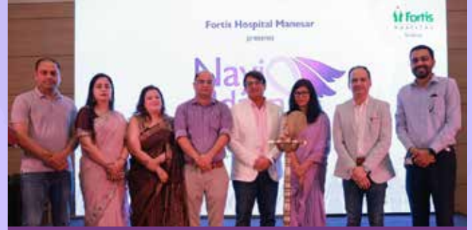
Fortis Hospital, Manesar