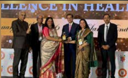
Fortis Escorts Hospital, Jaipur •Excellence in Nursing Practices