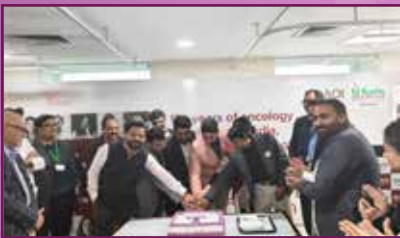
Fortis Hospital, Jalandhar