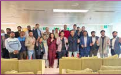
Fortis Hospital, Greater Noida