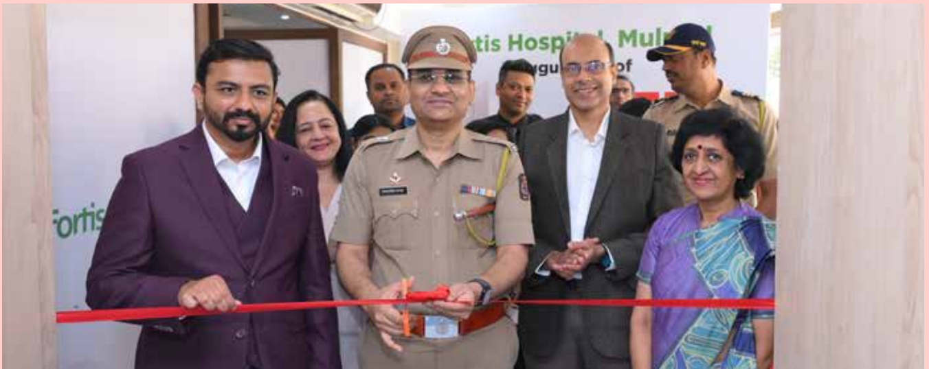
The inauguration ceremony in progress